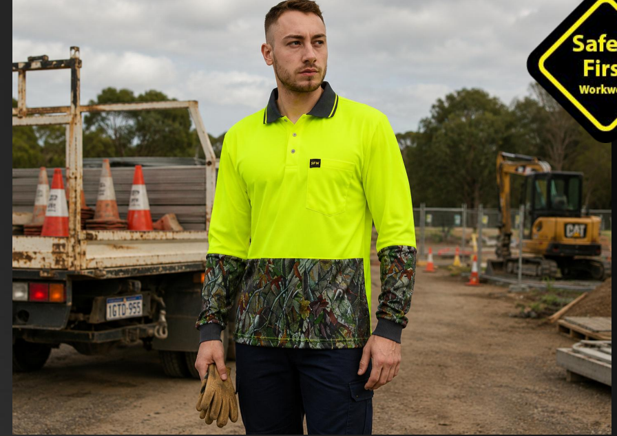
Style No: SFWP11 Hi Vis Polo