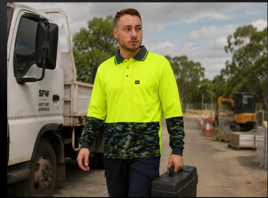
Style No: SFWP16 Hi Vis Polo