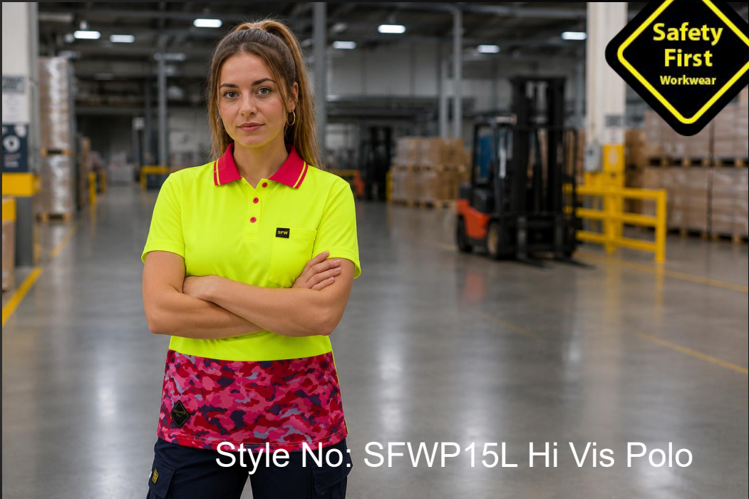
Style No: SFWP15L Hi Vis Polo

Just waiting for a logo All we need is your Brand.