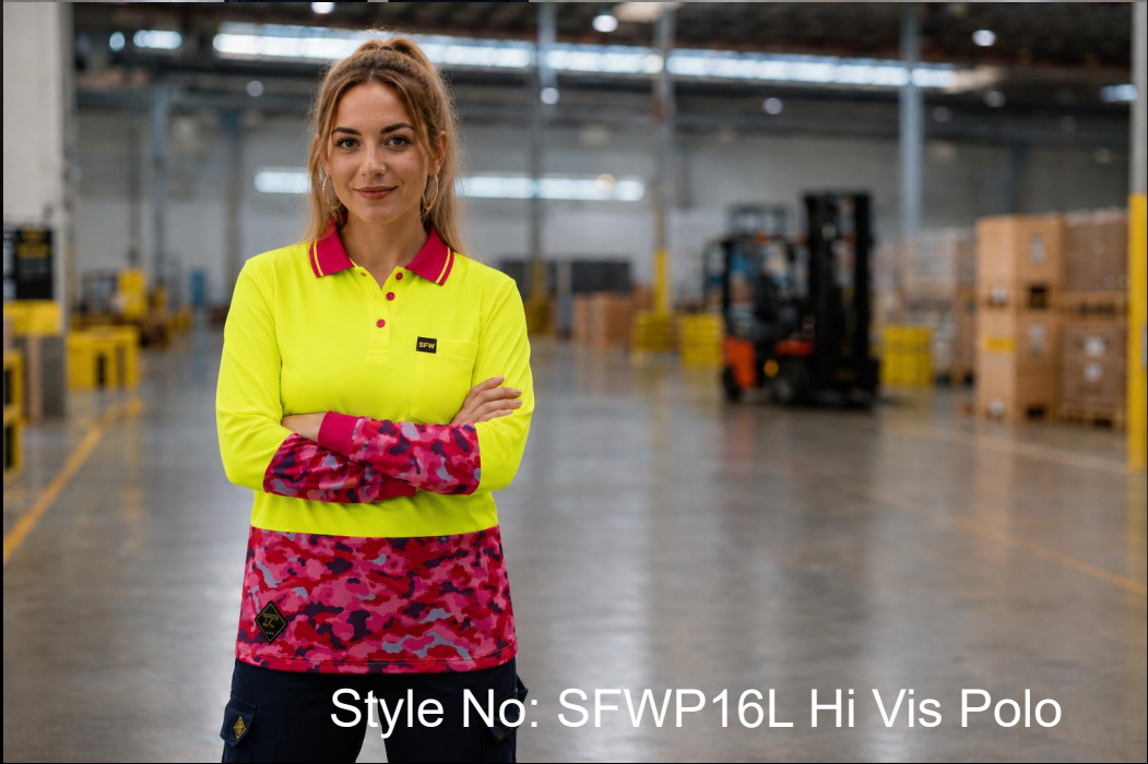
Style No: SFWP16L Hi Vis Polo