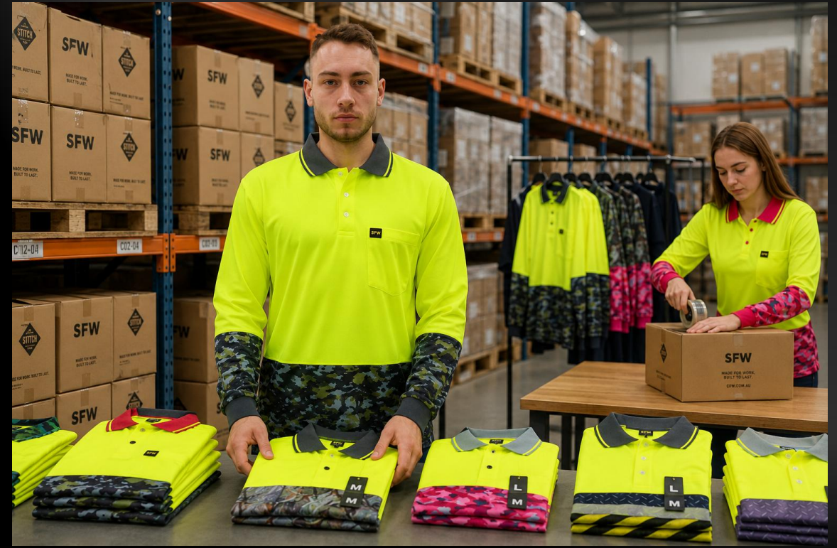
Style No: SFWP16/16L Hi Vis Polo

Practical range Core short sleeve, long sleeve and women's options