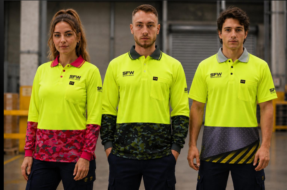
Style No: SFWP16L /16/ 20 Hi Vis Polo

Helps crews look aligned and work-ready.